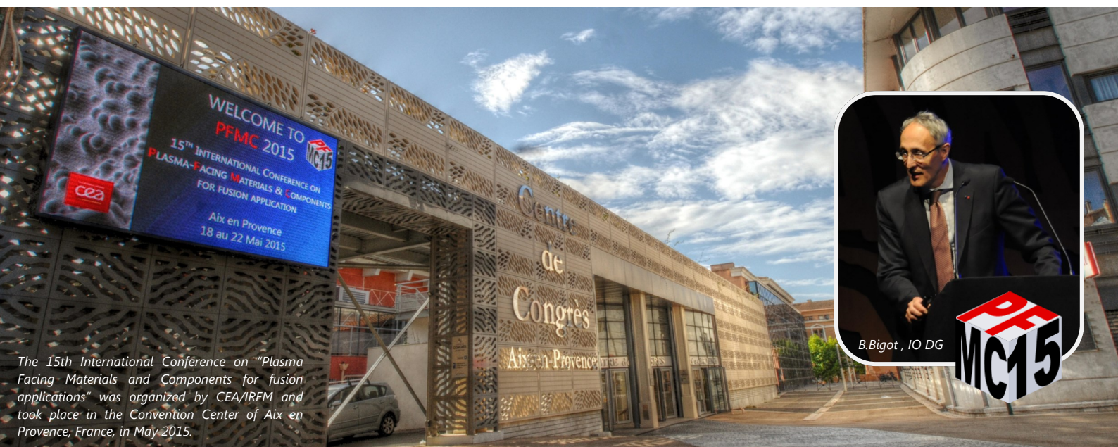
The 15th International Conference on "Plasma Facing Materials and Components for fusion applications" was organized by CEA/IRFM and took place in the Convention Center of Aix en Provence, France, in May 2015.

The 15 th international conference on "Plasma-Facing Materials and Components (PFMC) for fusion applications" took place from May 18 th to May 22 nd , 2015 in Aix-en-Provence, France, organized by CEA/IRFM.