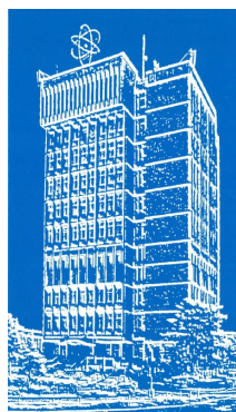
INSTITUTUL DE FIZICĂ ATOMICĂ, Bucharest-Măgurele, ROMANIA (artistic view)

Under the general cooperation agreement between CEA and IFA renewed at Bucharest on April 1st, 2015, IFA intends to become a partner of WEST and a member of the WEST Governing Board, which coordinates the implementation of the WEST programme. The joint efforts of IRFM and IFA focus on issues related to material development, characterization and testing under extreme environment. This includes in particular the development of innovative materials for fusion plasma facing components, the implementation of material related diagnostics of common interest.