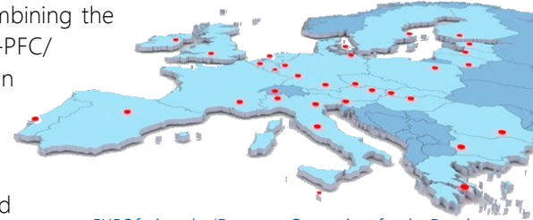
EUROfusion, the 'European Consortium for the Development of Fusion Energy', manages and funds European fusion research activities on behalf of Euratom.

The objective of the meeting was to set up an efficient implementation scheme for exploiting WEST as a European fusion facility from 2016 on. An integrated procedure was agreed, combining the international call for proposals planned for WEST in fall 2015 and the WP-PFC/EUROfusion PMU constrains. EUROfusion support will be available for the European fusion laboratories wishing to participate to WEST scientific campaigns for selected experiments, such as studies on the heat flux deposition pattern (SOL width), test of ITER grade Plasma Facing Components under high heat loads, or the characterization of tungsten sources contaminating the plasma. A dedicated EUROfusion Science meeting will be organized on November 25 th , 2015, in order for scientists from the European fusion laboratories to get an overview of the opportunities for participating in the WEST campaigns.